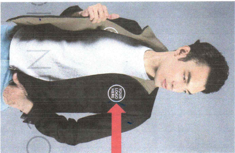
Outer Color: BLACK