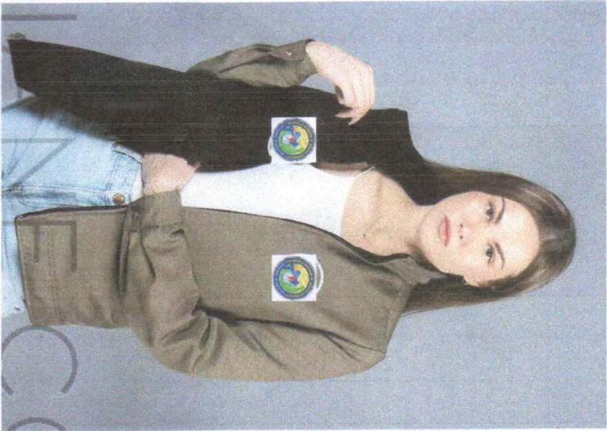
Inner Color: BEIGE