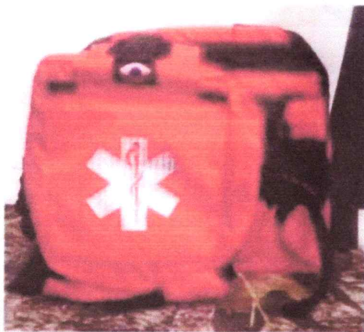
FIRST AID KIT (CHEST RIG)